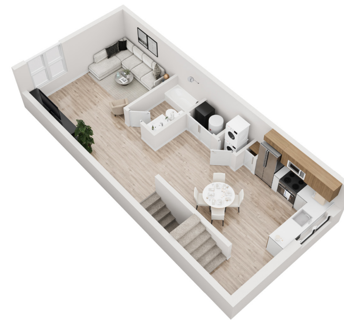
Interior Type 2