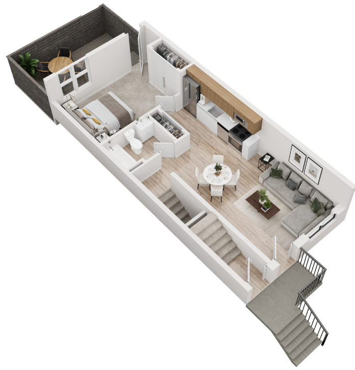
Interior Type 1