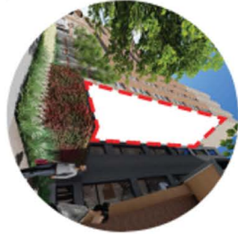
A Existing Garage Wall H = +/- 40' (6 Story) W = +/- 20'