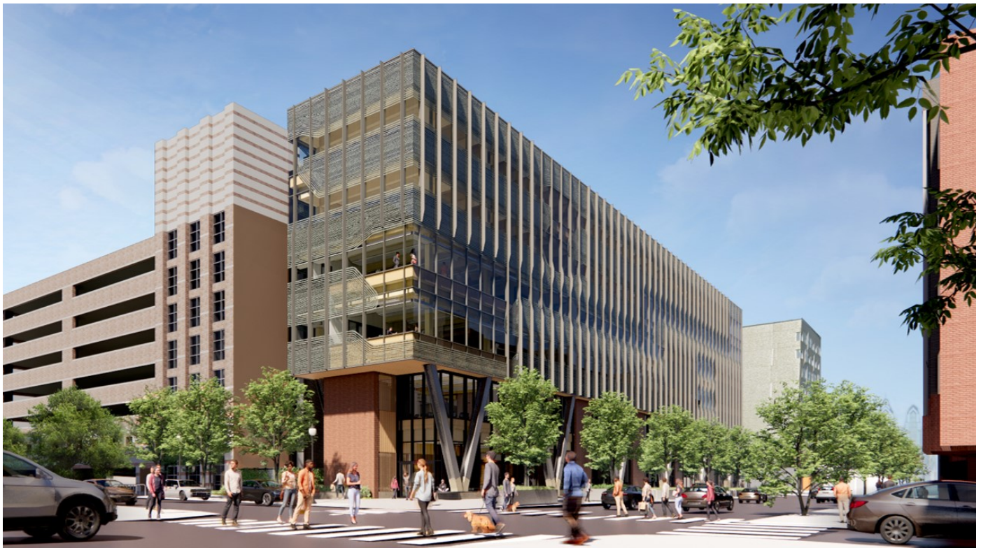
Southwest Perspective Rendering