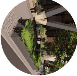
D Raised Planter x 6 H = +/- 3' W = +/- 6' L = Varies, +/- 17' to 21'