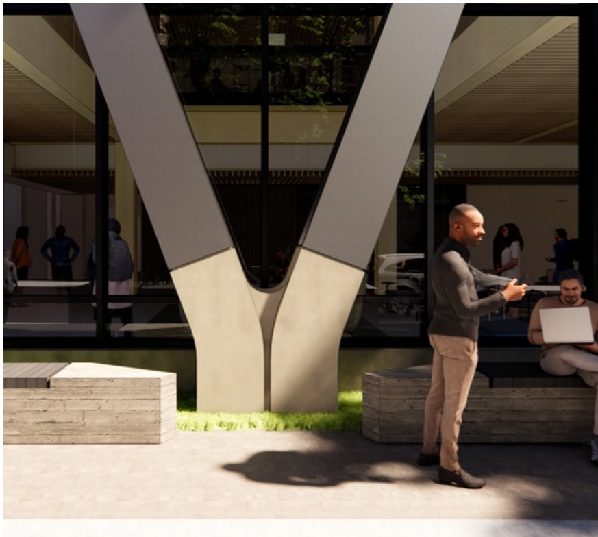
Rendering Showing Column Detail