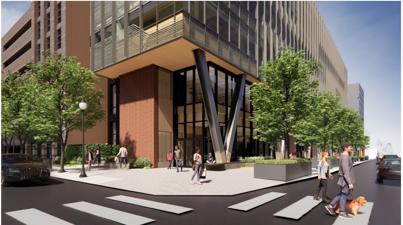
Main Entrance at Southwest Corner