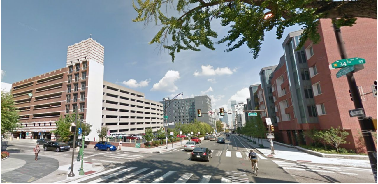
Existing Site Context