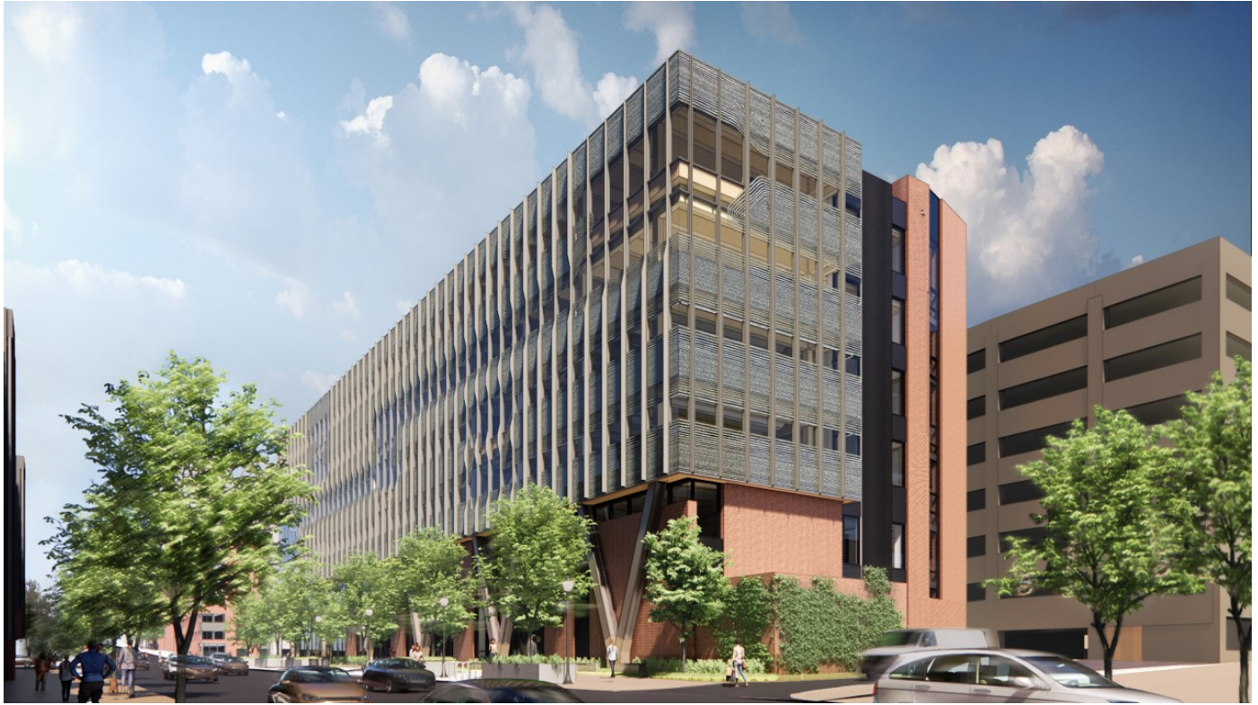
Southeast Perspective Rendering