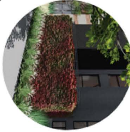
B Transformer Screening H = +/- 6' L = +/- 30'