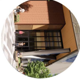
C Entry Plaza Art Zone Zone = +/- 290 SF