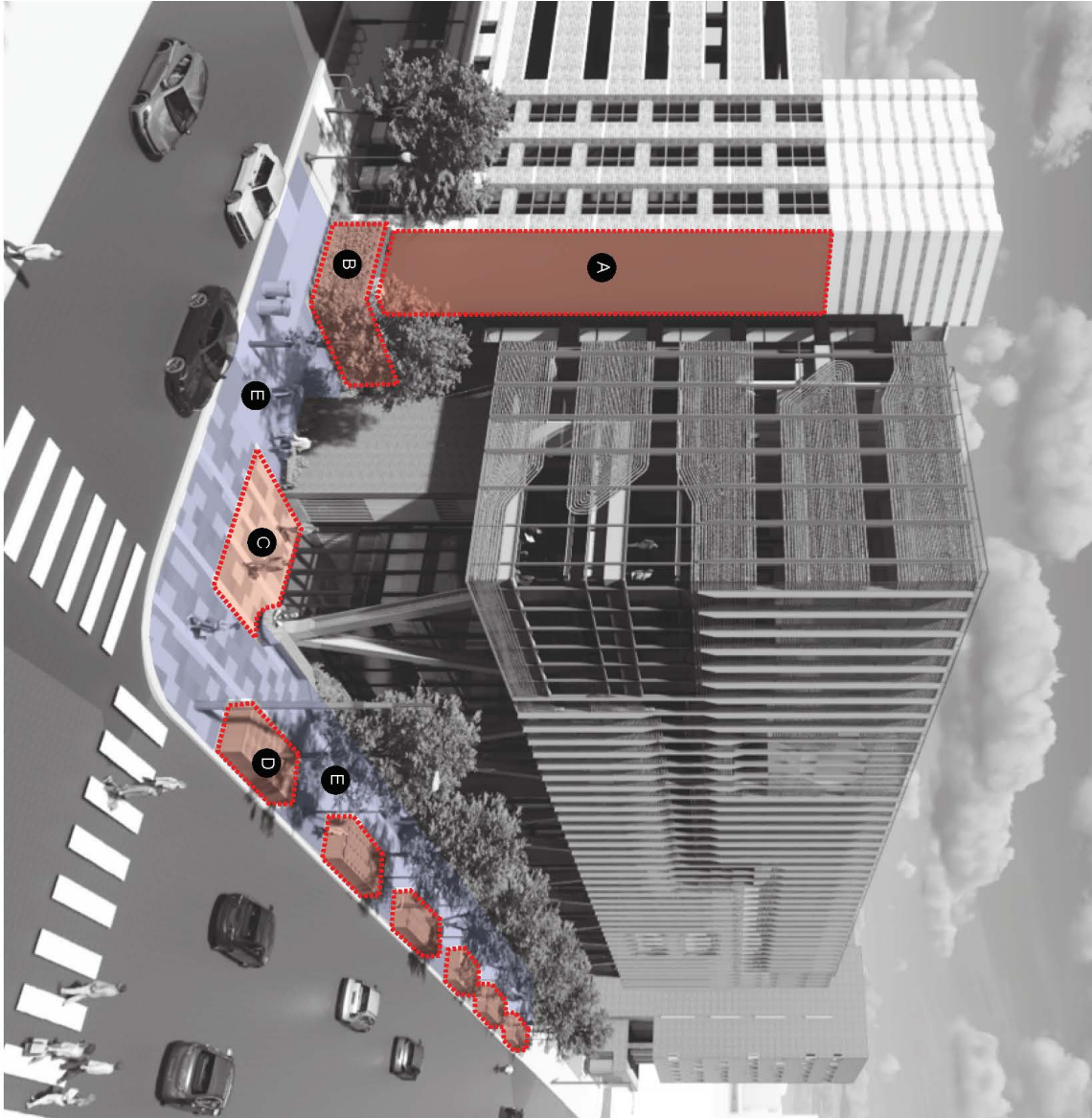
E Linear Landscape