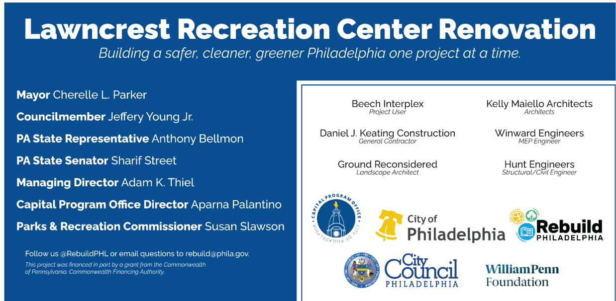
Project Identification Sign w/o Render for Rebuild Program Site