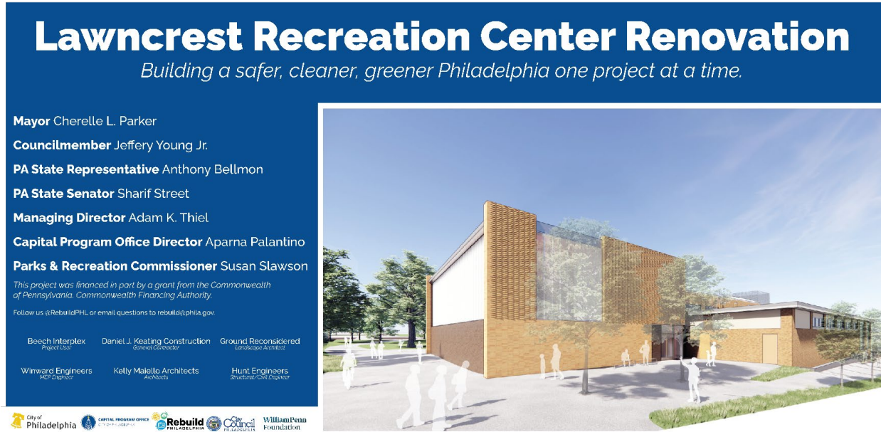
Project Identification Sign w/ Render for a Rebuild Program Site