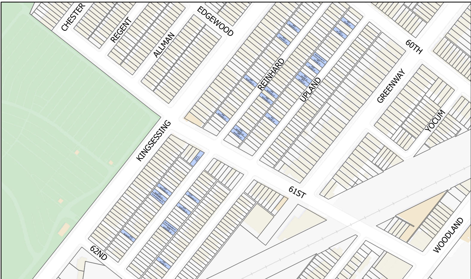
Sub Area #1