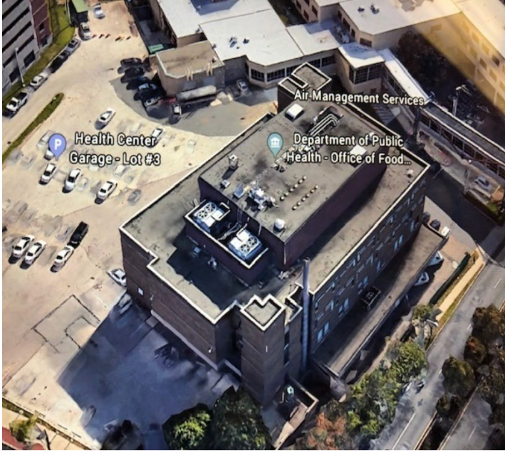
MEO, 321 S. University Avenue