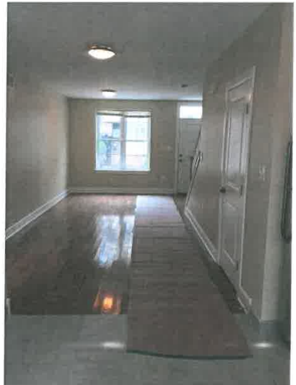
2325 Watkins Street (Rehabbed Unit)