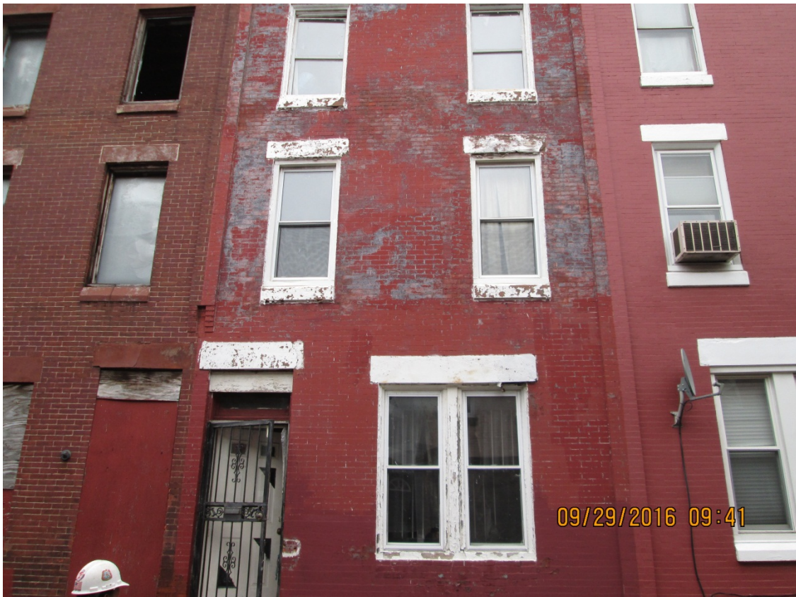
1307 N. Newkirk Street: