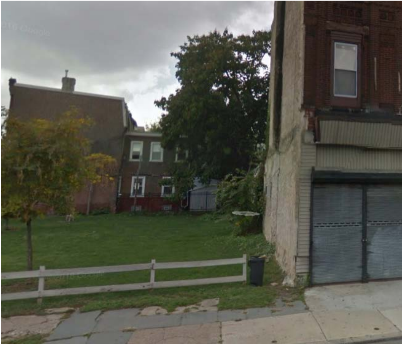
1824 Ridge Avenue