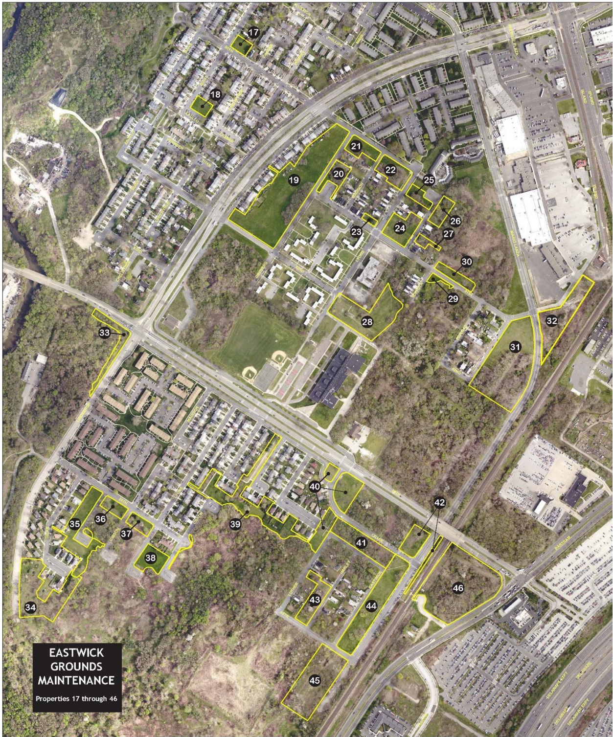
EASTWICK PARCELS MAP SOUTH